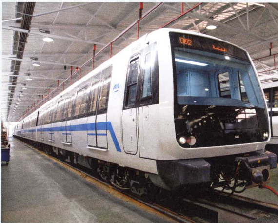
The vehicles are being tested by Siemens at Wildenrath prior to delivery.